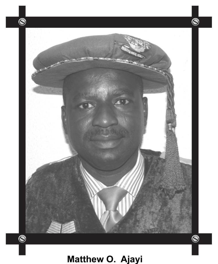
Department of Political Science And Dean College of Business and Social Sciences Covenant University, Canaanland, Ota.